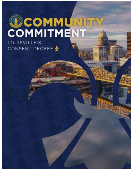
The Community Commitment